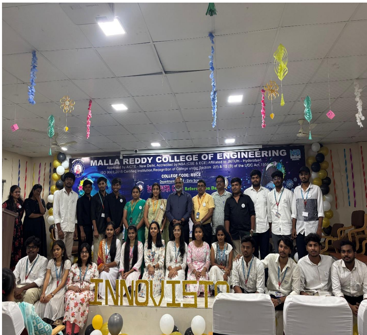
A CLICK WITH ALL INNOVISTA TEAM MEMBERS AND PRINCIPAL,HOD,FACULTY MEMBERS